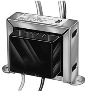
AT120B, AT140B, AT140D, AT150B