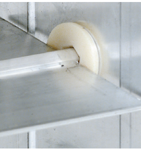
Parallel blade with extruded lip for low leakage.