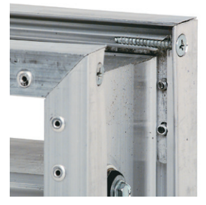
Durable construction — riveted and screwed corners.