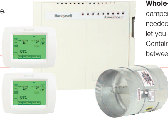
VisionPRO IAQ Total Home Comfort System: