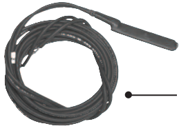
Outdoor Temperature Sensor

Precise Comfort Control (+/- 1°F) — Maintains consistent comfort to the highest level of accuracy.